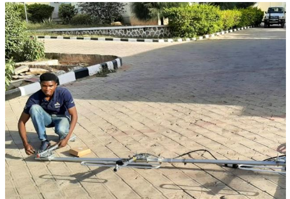
The ETS deploys telecommunications equipment during a mission to Yola.