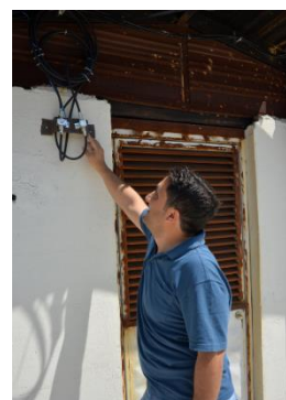
Assessing telecoms and IT connectivity at the UN hub in Gaziantep, Turkey.