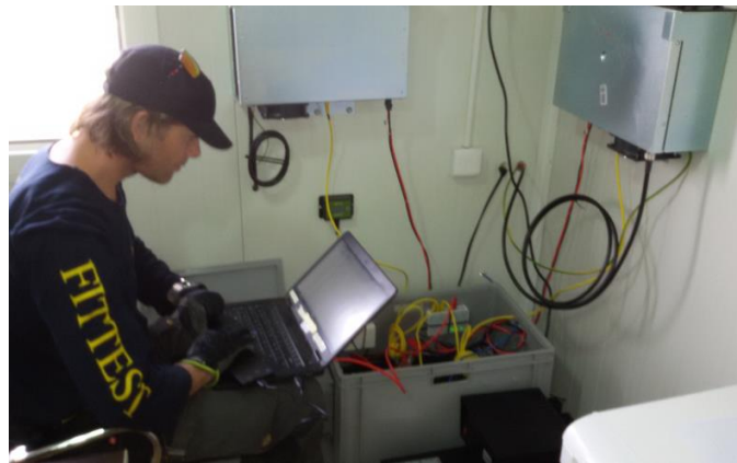
Photo: Maintenance of telecoms infrastructure at Domiz camp, Iraq.