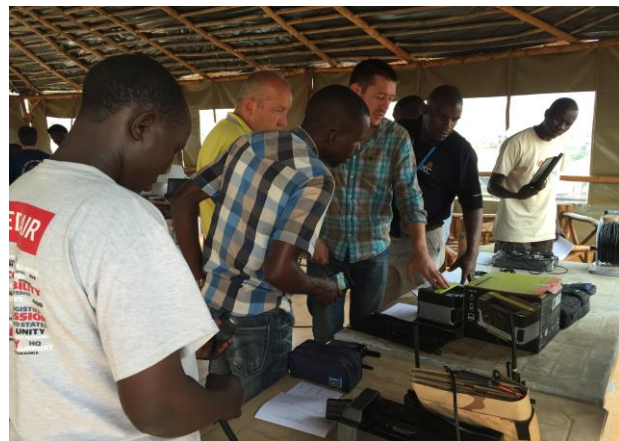
ETC technicians and partners sharing knowledge at the first IT emergency equipment fair in Juba