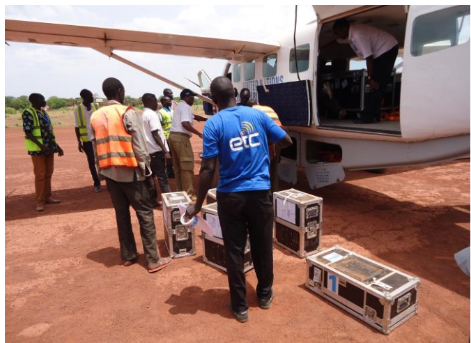
Transporting ETC equipment to reach the humanitarian community in remote areas of Unity State