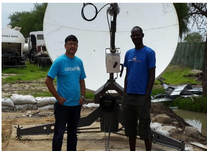
ETC and UNICEF with the newly installed emergency.lu internet response solution in Pibor (Jonglei State)