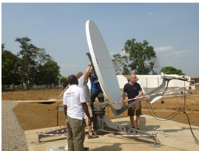
ETC team upgrading the VSAT in Port Loko, Sierra Leone.