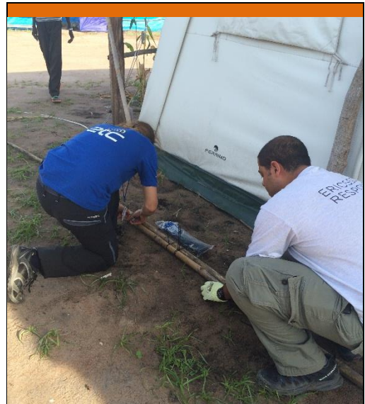
ETC and Ericsson Response teams fixing an additional Access point in Mingkaman